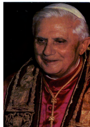
H.H. Pope Benedict XVI