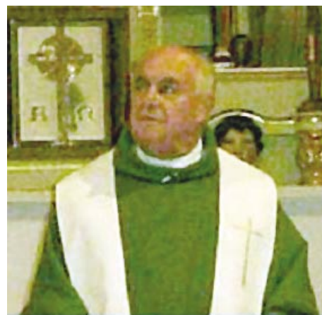
Homily at the 2004 World Assembly of Families.