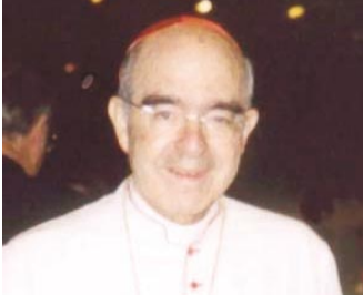
Alfonso Cardinal Lopez Trujillo