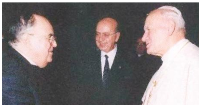
An audience with His Holiness Pope John Paul II